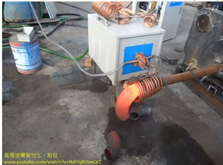
Fig. 1-1: Traditional elbows are manufactured by high-frequency heating in a processing plant

In the traditional elbow parts, except for the large-diameter elbows, which are made of multi-bend-pieces weld(mitres bend), the small-diameter elbows are mostly manufactured in the processing plant by high-frequency heating elbow type (see Fig. 1-1). It can be seen that the steel pipe (on the right side of the Fig.) is instantaneously heated to a high temperature of softening degree (partially and rapidly increase in temperature can be seen from the curved pipe of the red pass in the Fig.), expansion, bending, cutting, cooling (and rapid cooling?).