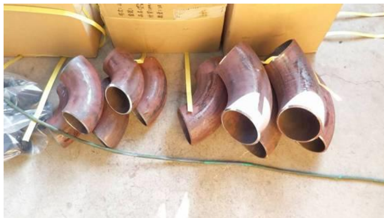
Fig. 1-2: Traditional elbows, packaging/transportation is quite time consuming [1]

This high-frequency heating elbow processing has several characteristics: