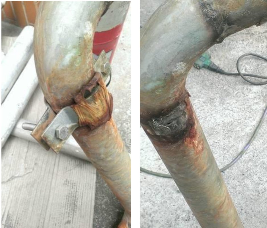
Fig. 1-4: Traditional elbow ring welds are more susceptible to cracking [1]

The lack of traditional elbow ring- welding joint has been described in the previous article [1] [2] [3], that's no longer speak. Before this new technology was developed, the only way to combine industrial pipe construction was the combination of ring-welding.