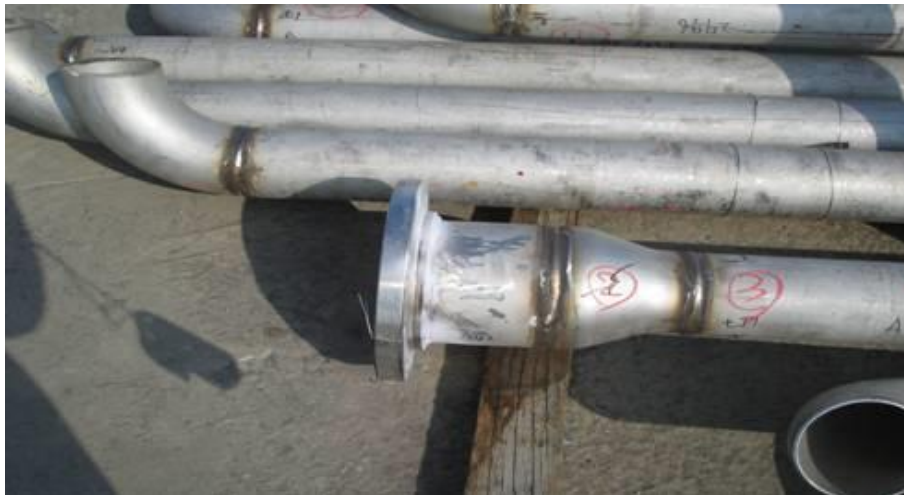
Fig. 1-3: Traditional elbows and straight pipes are welded by ring-weld joints (factory prefabricated)

In the pipeline prefabrication, taking the 90° elbow as an example, both of the front and rear ends are welded with the straight pipe by the ring-weld joint [2][3], usually at least one end is prefabricated at the factory, and the other end may be shop prefabricated or site weld (may facilitate re-delivery to the site or installation) (see Fig. 1-3). (Note: Factory prefabricated depending on the location, may be in the piping factory(shop), or in the temporary site (field) set up near the construction site)