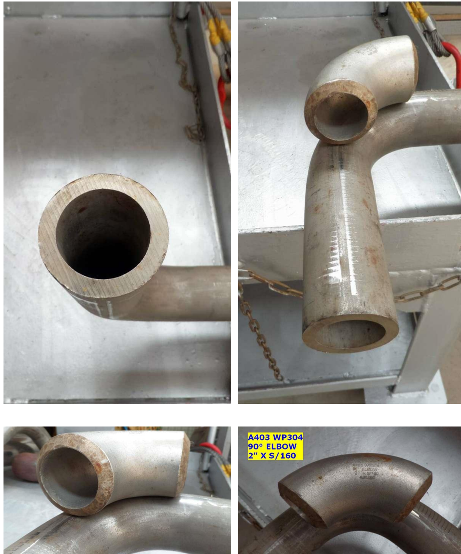
Fig. 2-5: Comparison of traditional elbows and DH pipe bends of 2" sch.160 SUS304

There are many kinds of pipelines in the petrochemical industry. The materials, pipe diameters and grades vary greatly. It is inconvenient to give an example. In the above picture, we use photos in comparison to make a simple explanation. The petrochemical industry has higher risks, and the owners are generally conservative. Engineers engaged in professional pipeline design are also more cautious. In the traditional pipeline system, taking elbow parts as an example, the damage occurs mostly in the weld bead of ring-welding (and the adjacent steel pipe base material), rarely occurs in the elbow body and the straight pipe. The reason is mainly due to high temperature welding, which destroys the original material.