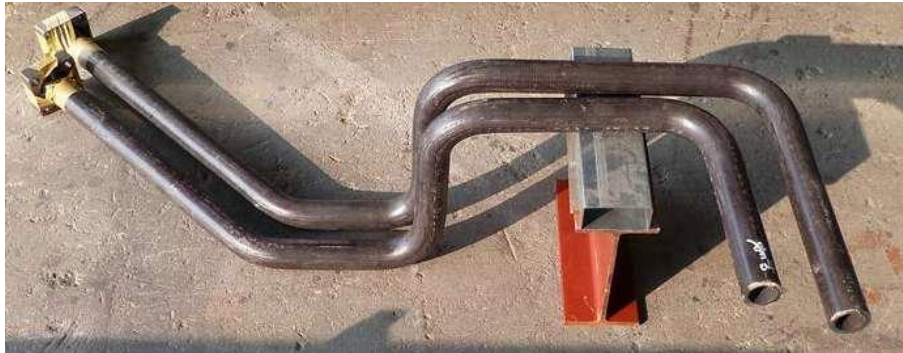
Fig. 0-1: 1.25" sch.160 pipeline

In this paper, the two 1.25" sch.160 hydraulic pipes shown in Fig. 0-1 are used as the main body to illustrate the high pressure resistance (inner pressure) characteristics of the DH Quick-Bending. For easy reading, more photos will be explained to avoid essays and academics.