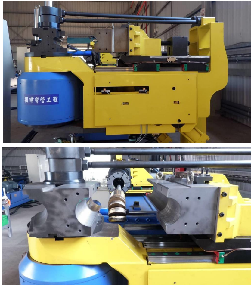
Fig. 2-6: Digital Bending Machine for DH Quick-Bending

Quick-Bending technology has emerged. With the more modern digital bending machine, more force output, higher precision, faster work speed and better quality have been able to meet the demands of all kinds of pipe bends, especially It can meet the needs of heavy industrial piping (such as petrochemical industry, steel industry, etc.) and is better. (See Fig. 2-6)